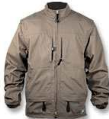
Scott eVest 2.0 $99.00 @ StylusCentral.Com Sizes: XS-XXL Colors: Olive and Black http://www.scottevest.com